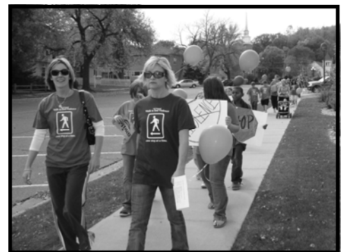
Supporters "taking the steps" to show their support for ending violence in Goodhue Co.

The event included a one-mile walk encompassing the downtown arts festival and ended with a balloon release in Central Park. The balloons were released during a moment of silence, in memory of all the silent victims of family and sexual violence.