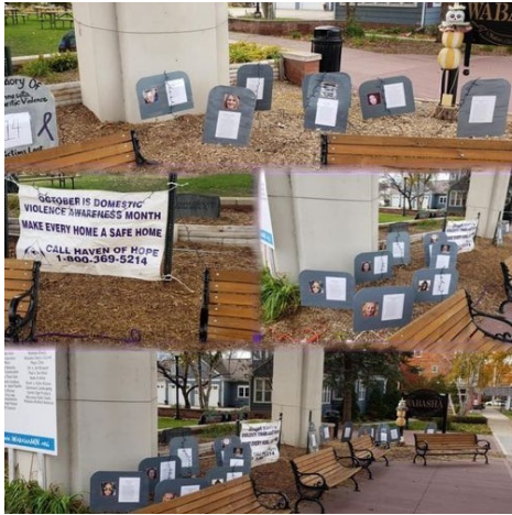
Domestic Violence Awareness Display in Wabasha.